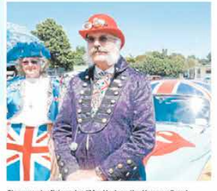
Steampunk aficionados "Mrs Hudson the Younger" and "Colonel Hawthorne" with a Morris 1000