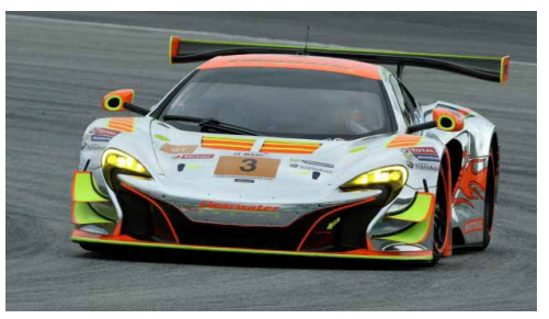
A McLaren GT racer during testing.

"It is fantastic. But the other side of it is I get really frustrated when I see drivers getting killed when they don't need to. If they had adopted our seats or the latest FIA standard earlier, then maybe they would still be with us."