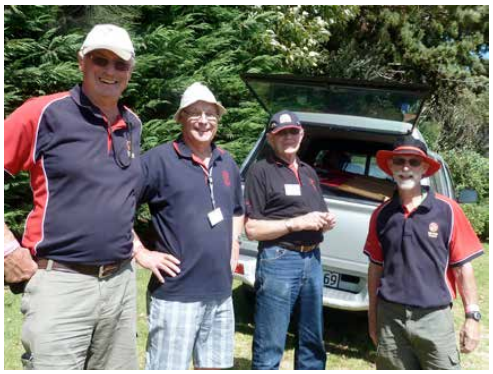
The clean-up crew