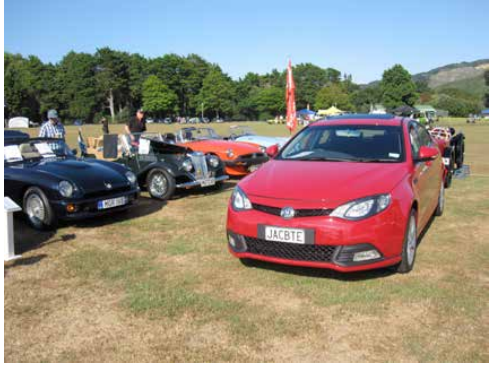
Newest - Iain Frazer's 2015 MG6