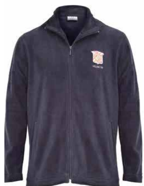
498Q - Gear, Zip fleece Navy - S-XL - $65.00.