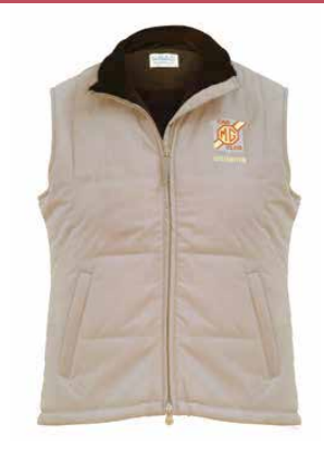
WLV - Gear, Women's Vest Silver/Black - S-XL - $65.00.

MG Car Club regalia can be purchased from Jane Hector, phone: 027 246 6034 or e-mail: jayhector70@gmail.com.