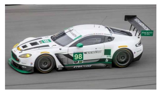
An Aston Martin Racing vehicle.