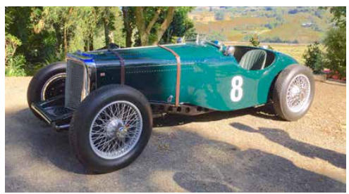
The magnificent racing Jaguar SS100