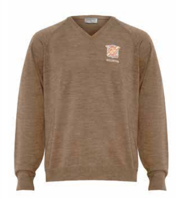
1634 - Silverdale, Merino pullover Natural mix - S-XL - $125.00.