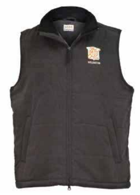
LV - Gear, Men's Vest Black - S-XL - $65.00.