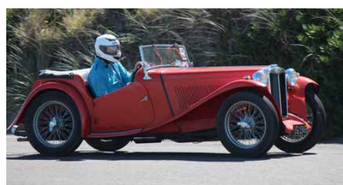
Selwyn Baxter (Wgtn)