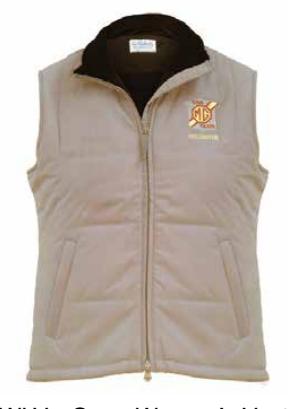
WLV - Gear, Women's Vest Silver/Black - S-XL - $65.00.