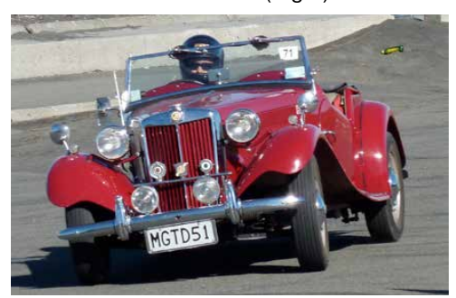
Rickie Pike (Wgtn)