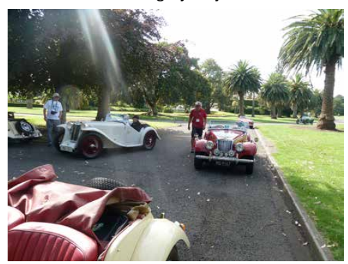
Looking for clues in the Botanical Gardens