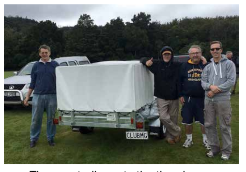
The new trailer gets the thumbs up