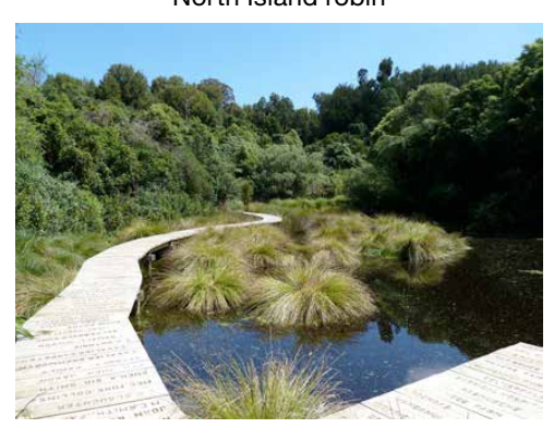
Bushy Park Wetlands walk