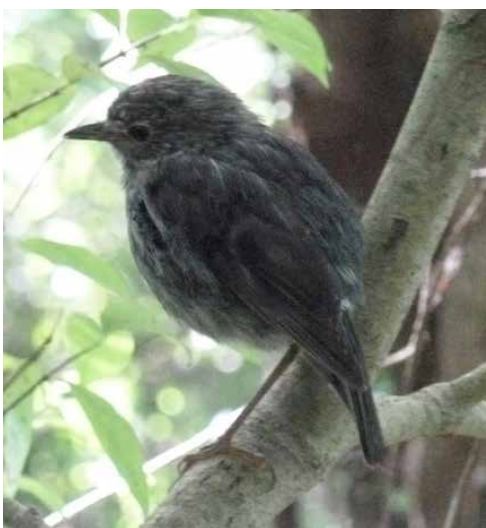
North Island robin