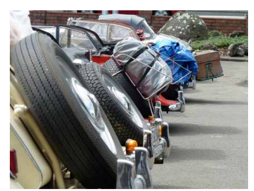
Well travelled MG's, Kingsgate carpark