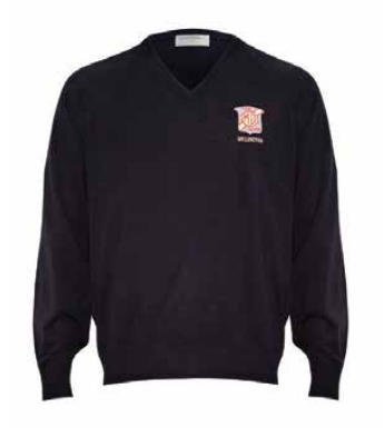
1634 - Silverdale, Merino pullover Navy - S-XL - $125.00.