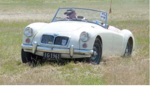
Ian Baxter (Wgtn)