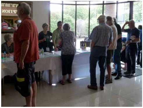
Reception & booking in