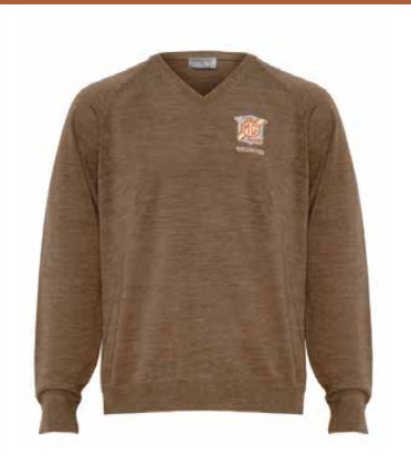
1634 - Silverdale, Merino pullover Natural mix - S-XL - $125.00.