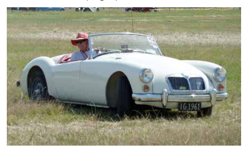
Gay Baxter (Wgtn)