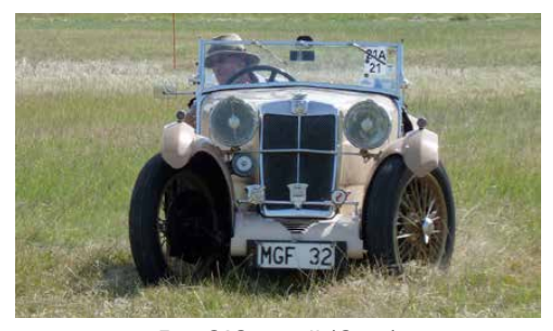
Pat O'Connell (Cant)