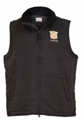
LV - Gear, Men's Vest Black - S-XL - $65.00.