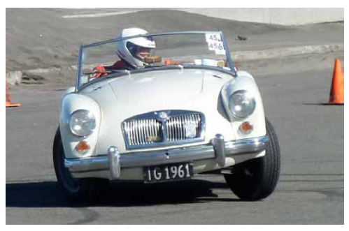
Ian Baxter (Wgtn)