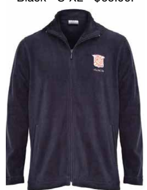
498Q - Gear, Zip fleece Navy - S-XL - $65.00.

MG Car Club regalia can be purchased from Michael Shouse phone: 04 297 2279 or email: upnzway@earthlink.net.