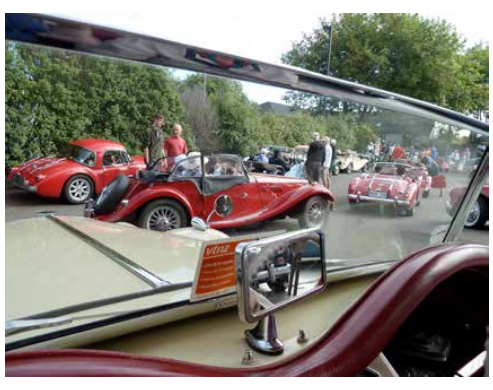
The rush to start