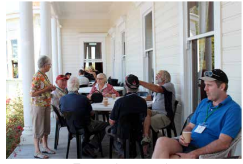
Tea on the veranda